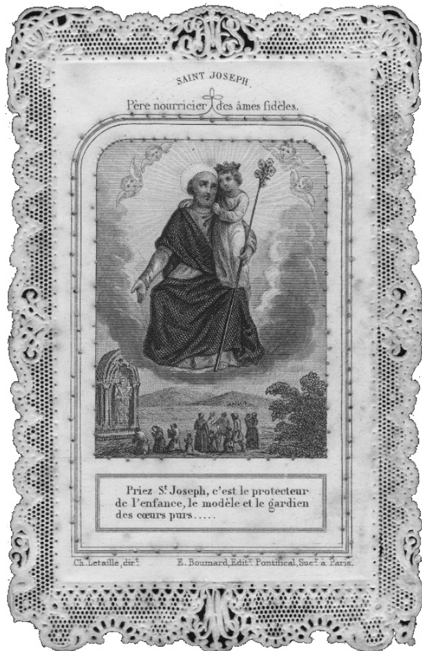
St Joseph, Foster Father of Faithful Souls